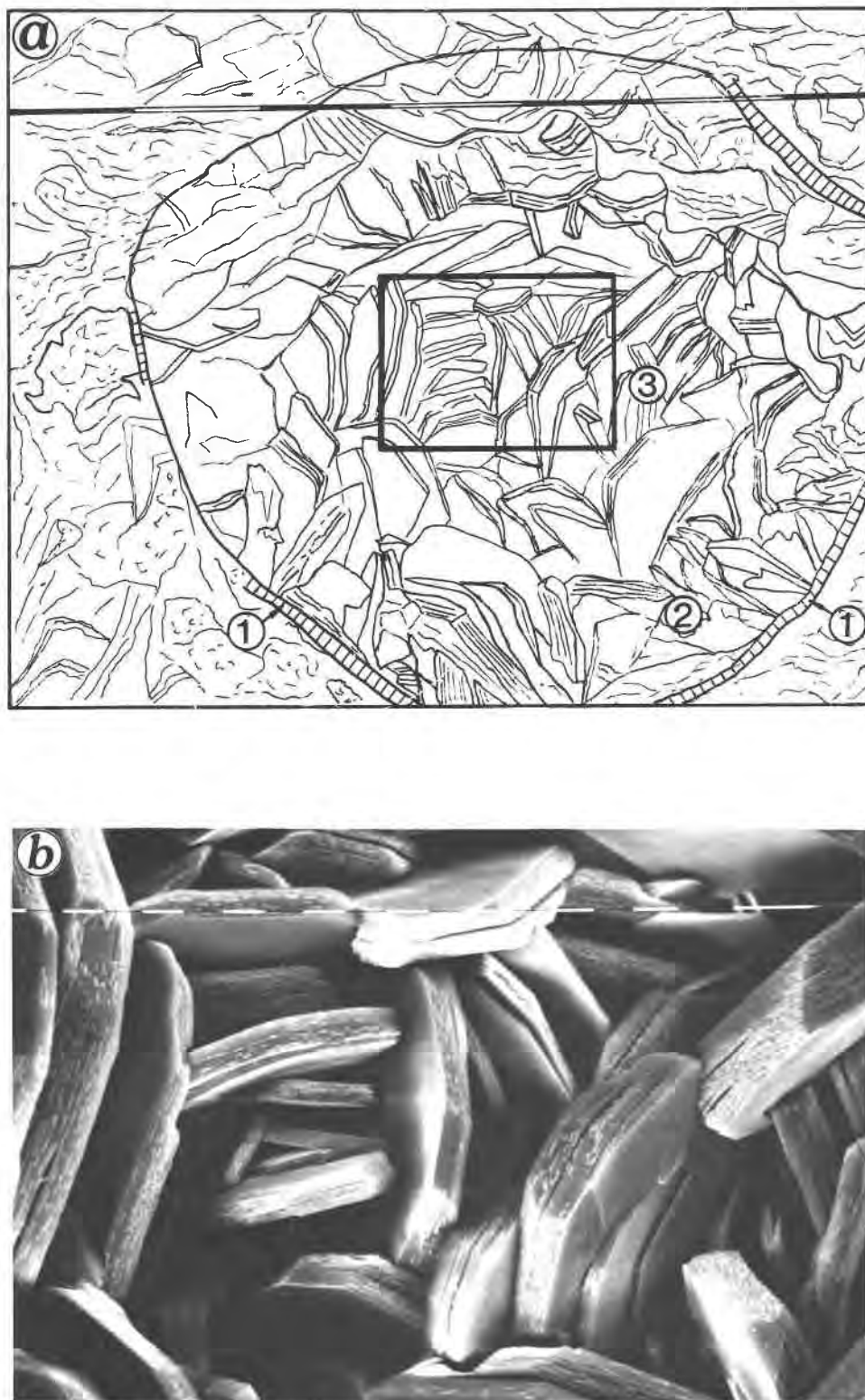
Fig. 2. (a) Sketch of a vesicle filled by motukoreaite generalized from a scanning electron micrograph. The crystallization sequence is thin fibrous fringe (1), followed by macrocrystalline radiating bundles (2), and macrocrystalline booklike packages filling the remainder of vesicle space (3). (b) Enlarged view framed in (a) showing well-developed hexagonal motukoreaite crystals typical of open-cavity growth.