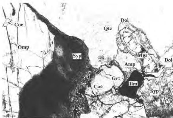
Fig. 2. Magnesite rimmed by dolomite in contact with a symplectite (Syp) after omphacite; secondary amphibole occurs at the contact between magnesite and garnet, both suggesting the former coexistence of magnesite, garnet, and omphacite. Both omphacite and garnet contain inclusions of coesite and pseudomorph after coesite. Plane-polarized light, width of field: 1.44 mm.

Compositions of magnesite and coexisting phases (e.g., garnet, orthopyroxene, clinopyroxene) are listed in Table 1. The magnesite in garnet websterite is nearly Ca-free, with a Mg/(Mg + Fe) ratio of 0.94. This Mg-rich magnesite is distinctly different from magnesite in the Norwegian magnesite + orthopyroxene eclogite, which contains 0.01–0.06 Ca, 0.09–0.12 Fe, 0.82–0.90 Mg pfu. Orthopyroxene in garnet websterite from the Bixiling complex contains very low Al 2 O 3 (0.11–0.13 wt%); diopside contains 3.5–3.8 wt% Na 2 O and has a Ca:Fe:Mg ratio of 44:09:46; garnet is Mg-rich, at about 63 mol% pyrope. Metamorphic temperatures were estimated using the clinopyroxene-garnet (Krogh, 1988), orthopyroxene-garnet (Lee and Ganguly, 1988), and orthopyroxene-clinopyroxene (Wood and Banno, 1973) geothermometers; the average temperatures were 888, 783, and 820 °C, respectively. The very low Al 2 O 3 content of enstatite yield-