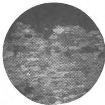
FIG. 2. As in Fig. 1. (Between crossed nicols)

of movement through pressure, during the period of crystallization, in overcoming the natural tendency of the crystal to grow in the direction of its c axis. A close study of the microphotograph will reveal the fact that there is even in this case, in places, an elongation along the cleavage lines, but broken by the very definite bands of quartz crystals in the direction of movement. On the (010) face, the angle of extinction varies from 3 to 7 degrees, measured from the (100) cleavage trace. In sections on the (100) face, the extinction angle is 30 degrees with the fair cleavage trace of (010). An irregular basal cleavage is also noted.