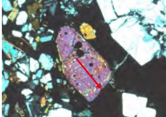
e) Fish Canyon Tuff (intracaldera)