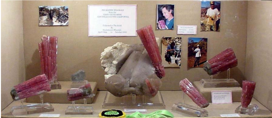
Figure 1. Tourmaline crystals obtained from mining at the Cryo Genie pegmatite in 2001, on display at the 2002 Tucson Gem & Mineral Show.