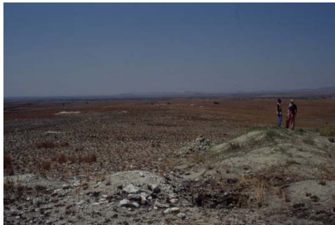
Figure 9 – Outcrop in the area of occurrence of the gemmy yellow K-feldspar. West of the Benono village, Betroka area.