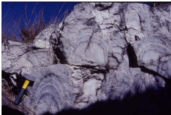
Figure 7 – Outcrop showing spectacular “line rock” structures in an aplitic-pegmatitic dike at Ambalamahatsara, Ambatofinandrahana region.