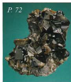
Cassiterite; 14 cm; Viloco G. Witters collection