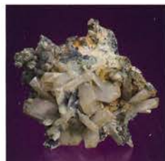
Valentinite; 5 cm Tatasí; Canadian Museum of Nature